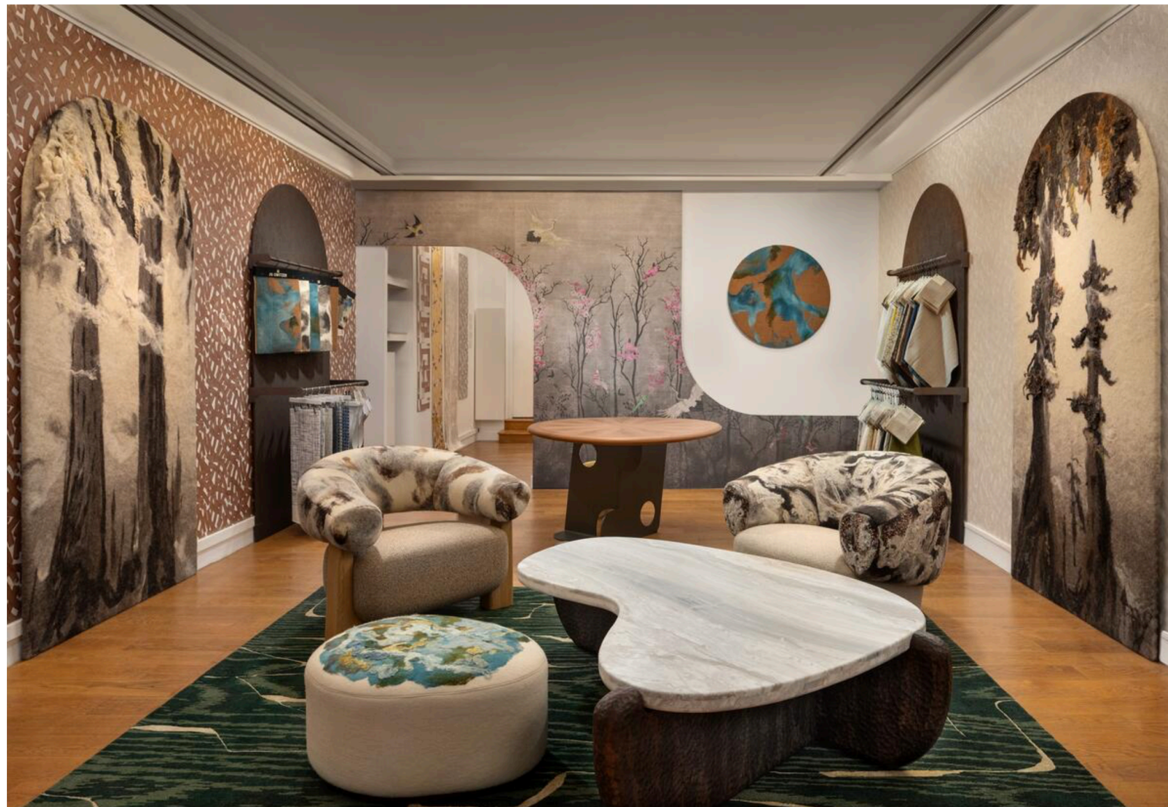
A selection of designs from Jiun Ho's Privé collection, including the Hera coffee table.

The latest wave of collectible designs showcase the singular nature of their craft.