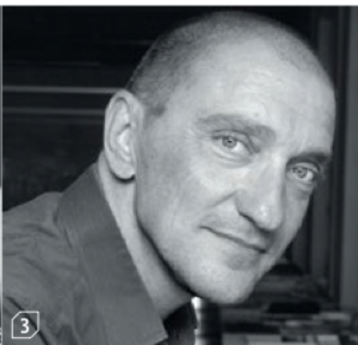
Rodolfo Dordoni for Poliform

product Giò standout A tribute to Giò Ponti, this side table juxtaposes rational lines and calibrated slants of Spessart oak-finished wood composite with a lacquered-aluminum chest of drawers. poliformusa.com . circle 418