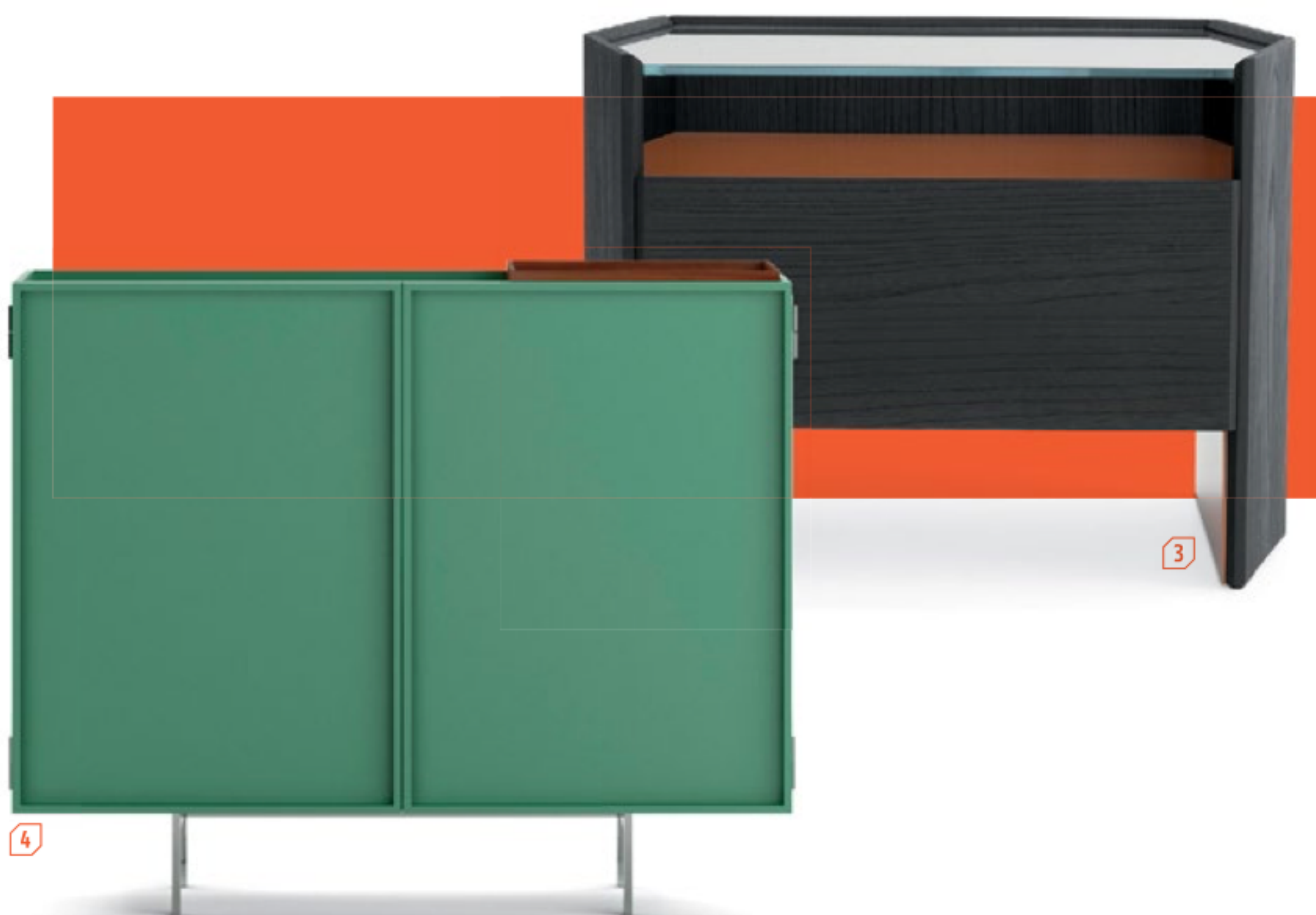
Piero Lissoni for Cappellini