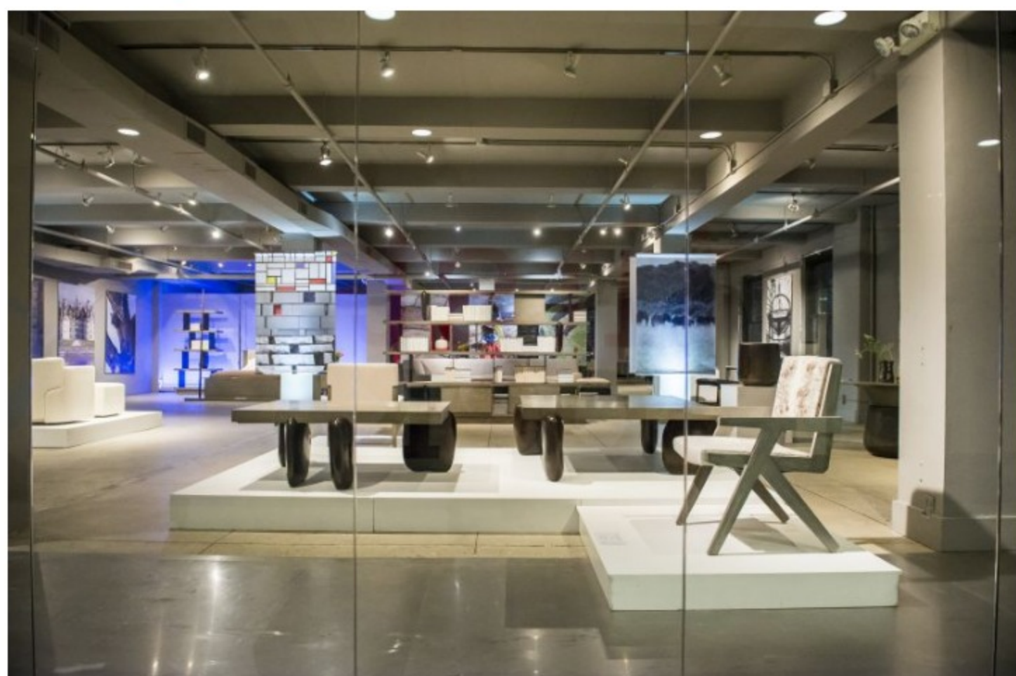
Jiun Ho Collection V

The New York Design Center is located at 200 Lexington Avenue, NYC 10016.