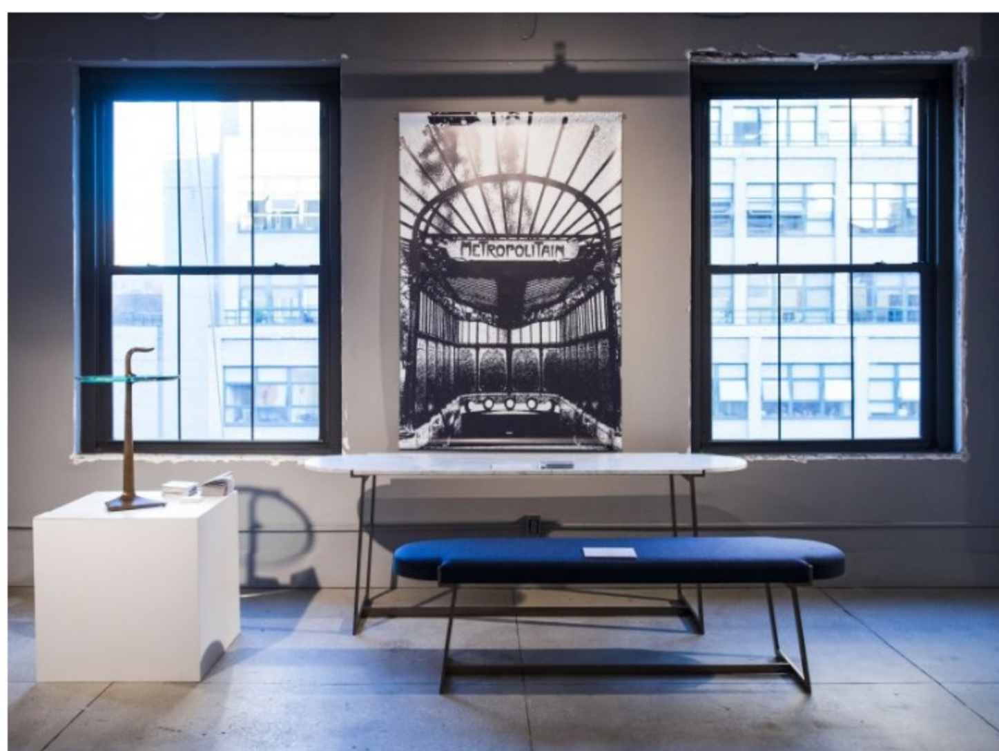
Jiun Ho Collection V.