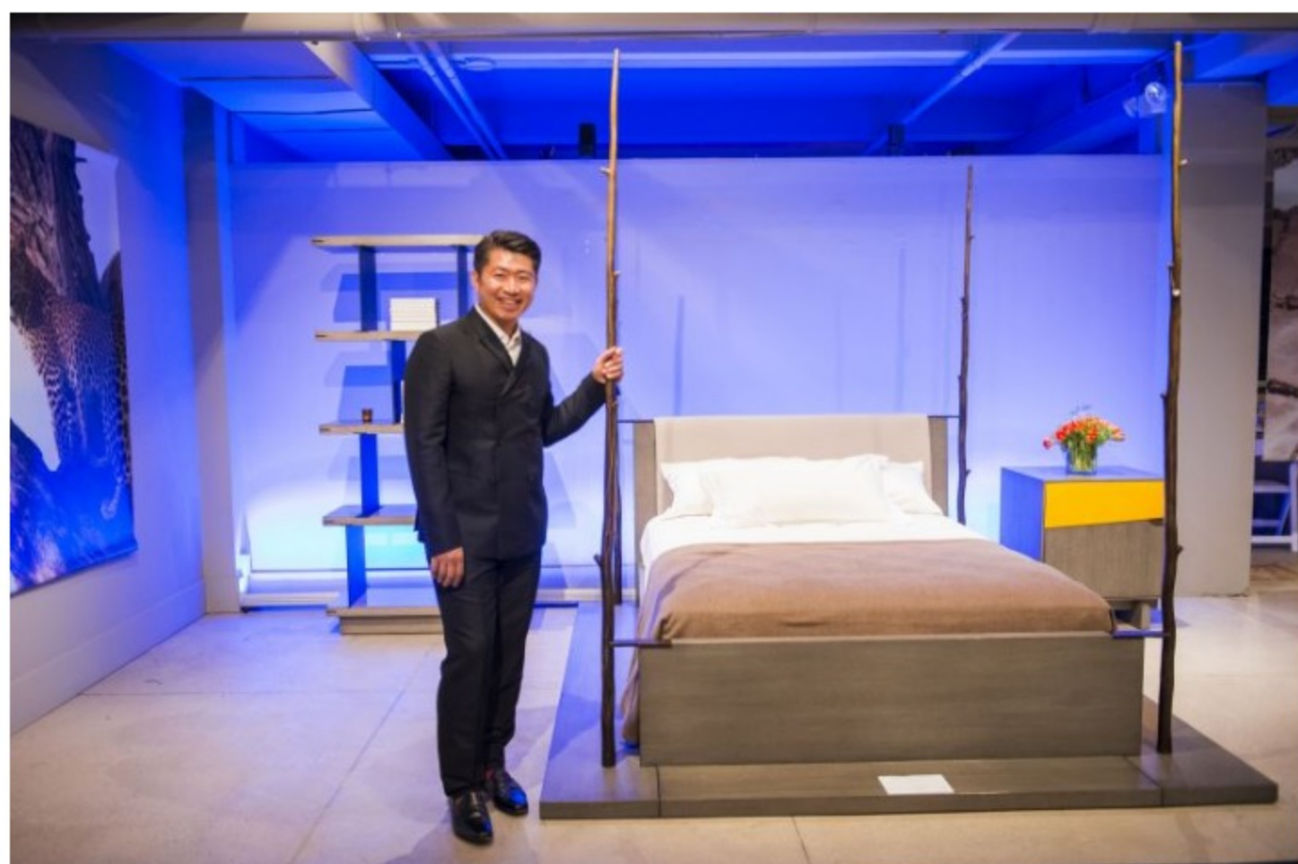
Jiun Ho Collection V