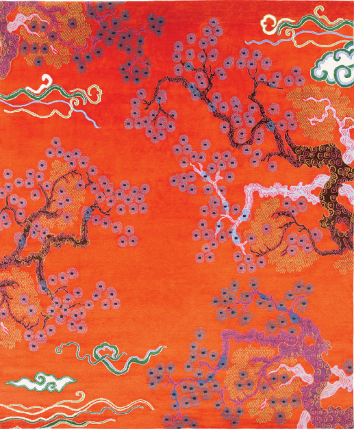
Tree and Cloud, Persimmon, 100 knot wool, silk 8' 2" x 9' 11"

Reimagining botanical motifs in contemporary forms, Carini Carpets brings a new collection of floral-inspired rug designs into play. Building on their mission to create soulful, sustainable, timeless pieces, the collection places a modern lens on delicate vine-like patterns, oversize blooms and abstract interpretations of nature. carinicarpets.com