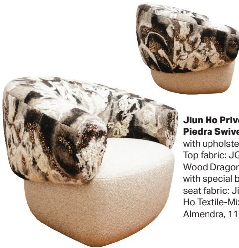
Jiun Ho Privé Piedra Swivel Chair with upholstered base. Top fabric: JG Switzer- Wood Dragon Wool-Dark with special beading seat fabric: Jiun Ho Textile-Mixteca Almendra, 1115-06

Striking a balance between timeless craftsmanship and innovative design, the Lund Collection from JD Staron pairs the simple, functional beauty of Bauhaus design with the rich heritage of Swedish rug weaving. The collection blends traditional flat weaving techniques with plush pile and striking pattern, reimagining classic methods and motifs for modern living. jdstaron.com