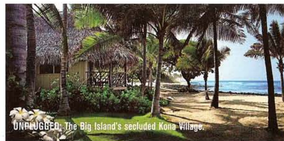
UNPLUGGED: The Big Island's secluded Kona Village.

It doesn't open until the end of summer or early fall, but the Hotel Renew (129 Paoakalani Ave.) is already the most talked-about new hotel in Honolulu since the 50-room W debuted in Diamond Head in 1999. San Francisco-based furniture designer Jiun Ho has completely and beautifully transformed what was formerly a less-than-desirable tourist hotel, located within easy walking distance of Waikiki beach in the heart of Honolulu's shopping district. Valuing tranquility and restfulness, Ho incorporates elements of the island's natural environment. Water features and driftwood encapsulate the area's coastal beauty, fire elements are inspired by the volcano, and light-colored fabrics and patterns remind guests of the rolling waves outside. Decorated with local artwork and accented with dark woods, the hotel creates a sheltered intimacy in the midst of a vibrant social scene. Each of the 70 rooms is outfitted with a plasma TV (some rooms even feature projection TVs with 4-foot-by-6-foot displays!), Wi-Fi and iPod docks, not to mention extra-large beach towels. 808.687.7715 or www.hotelrenew.com . —JC MacMillan