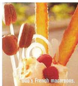
Duo's French macarons.