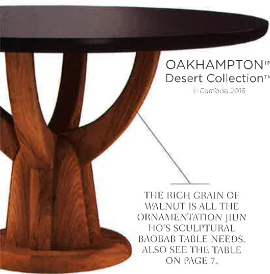
OAKHAMPTON™ Desert Collection™ © Cambria 2016

The natural world speaks volumes to Jiun Ho. Besides using natural forms as starting points for his furniture designs, like the Hwange table base on page 7, Ho incorporates rich natural textures into every space. "I look at the landscape and see all the different elements—wood, stone, water—and bring those inside. This approach is one thing that drew me to Cambria®. The Coastal Collection™, for example, has such a fluid, natural look. I love to use it in kitchens, and also in less-expected ways: as a tabletop, or on the walls," says Ho. When using rich, natural materials, Ho prefers to keep the lines of his furnishings simple. "It's about creating something timeless. Pure, basic shapes and forms—there's nothing better."