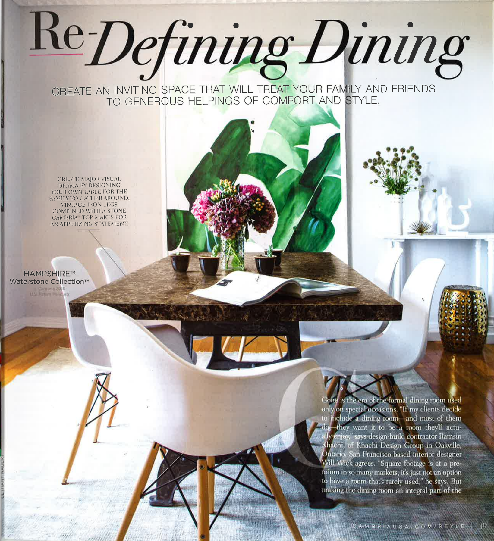
HAMPSHIRE™ Waterstone Collection™ Cambria 2016 U.S. Patent Pending